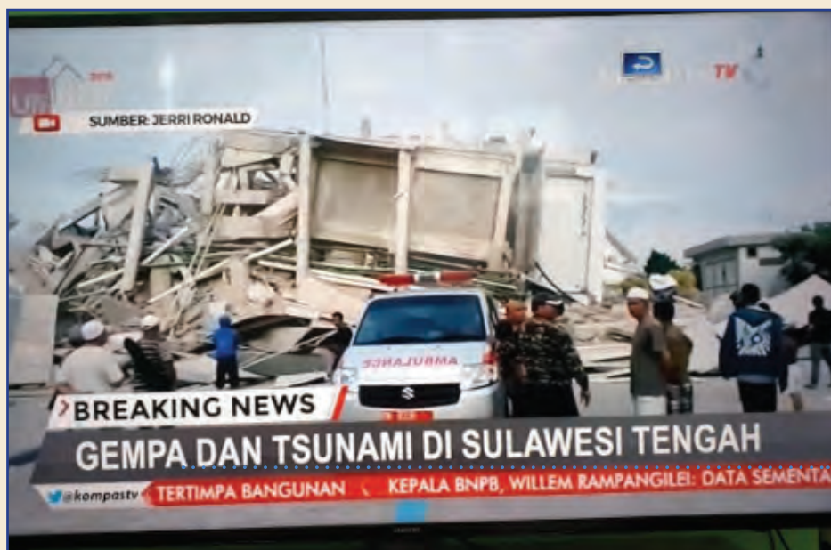
What is left of the Roa2 hotel where we were supposed to stay.